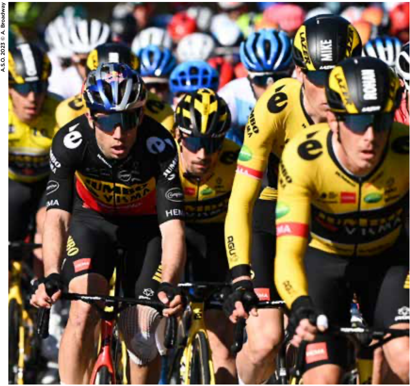
A.S.O. 2023 © A. Broadway